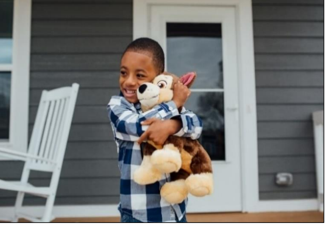
JPIC 2023 Advent Alternative Gift Fair 9 of 15