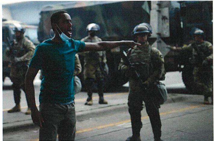
A man in Minneapolis is seen near National Guard members May 29 guarding the area in the aftermath of a protest over the death of George Floyd, an African American, while in the custody of a white police officer.

This is where things may get uncomfortable for most of you, who I assume (and hope) will be white. Because just as no one gave her an explicit class on the ways of whiteness and how it works in society — and for her — most likely you never received a formal class or explanation either. It's just something that you know, or better, that you realize on some distant yet real part of your brain. At some early age, you realized that no matter how bad things got for you, at least you would never be black. And it dawned on you, though you rarely consciously say it, that you would never want to be black. Because you realized, even without being explicitly told, that being white makes life easier. Even if you have to do some hard work along the way, at least you don't have to carry the burden of blackness as a hindrance.