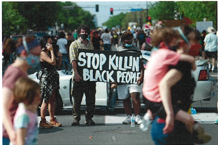
Protesters in Minneapolis gather at the scene May 27 where George Floyd, an unarmed black man, was pinned down by a police officer kneeling on his neck before later dying in hospital May 25.

But just because we cannot do everything doesn't mean we should not do something. We are not as helpless as we fear. Moreover, helplessness is an emotion that we cannot afford to indulge. As James Baldwin believed, despair is an option that only the comfortable can afford to entertain.